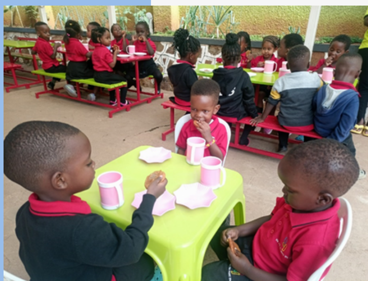
STUDENTS ENJOYING A MEAL

When there is teamwork and collaboration, wonderful things can be achieved. – Mattie Stepanek