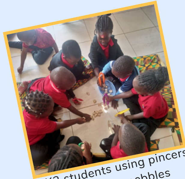
K2 students using pincers to pick up pebbles