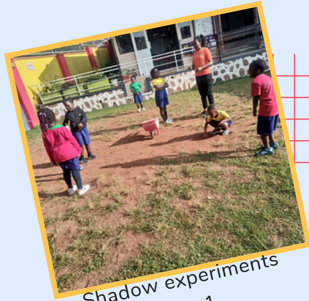
Shadow experiments Year 1