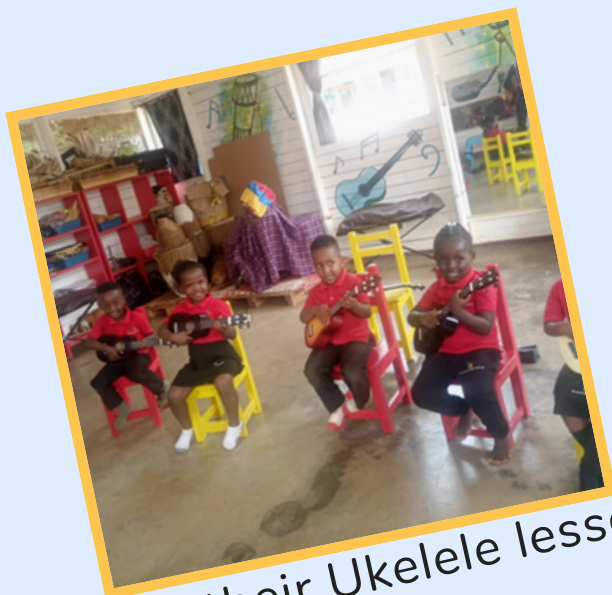
K2 in their Ukelele lesson