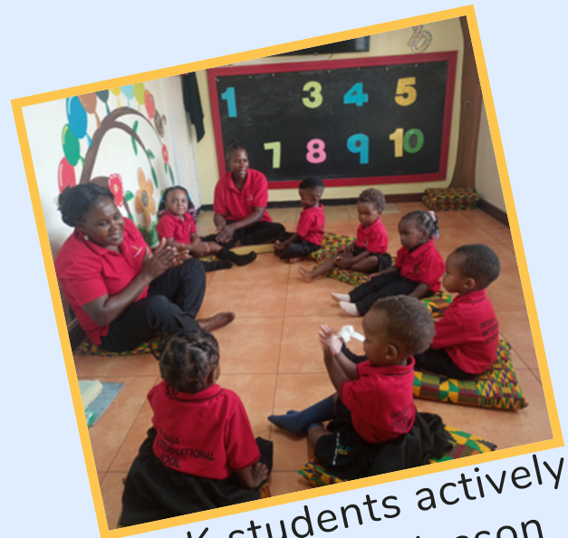
Pre-K students actively engaged in a lesson