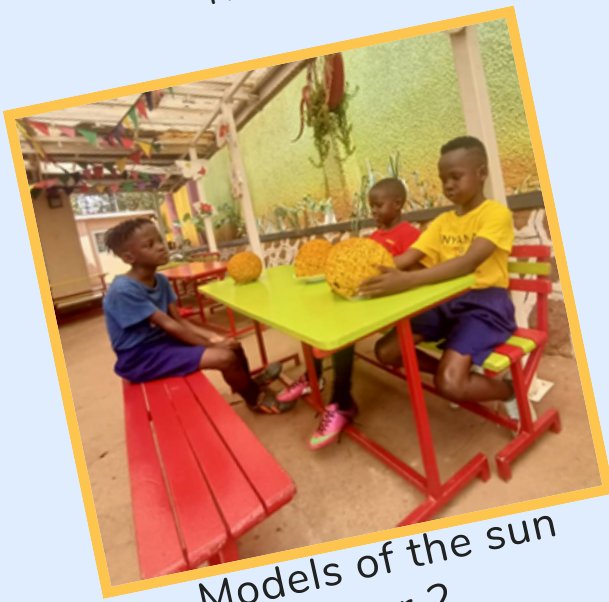
Models of the sun Year 2